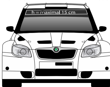
FRONTSCHIEBE LT. ARTIKEL 18.7.4 national